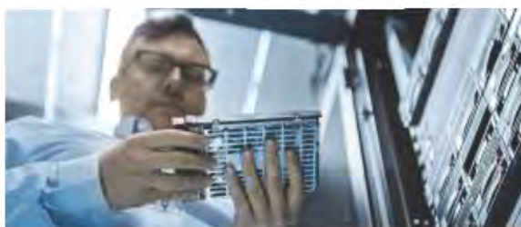
Day the Music Died