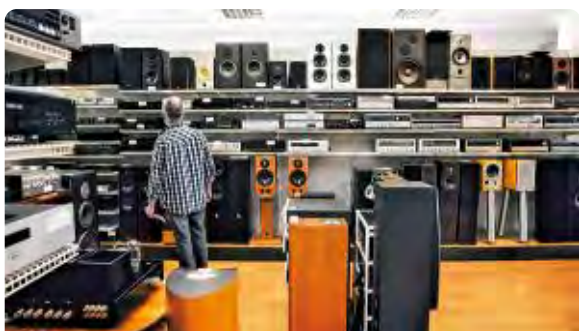
Buying hi-fi on a budget