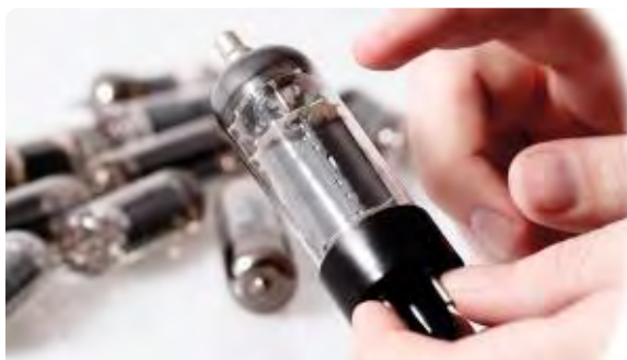
Valves: ready to roll?