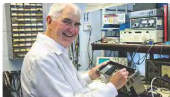
Quad to the Core