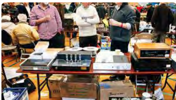
Vintage hi-fi: what's hot?