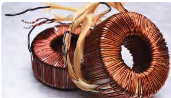
Know Your Transformers