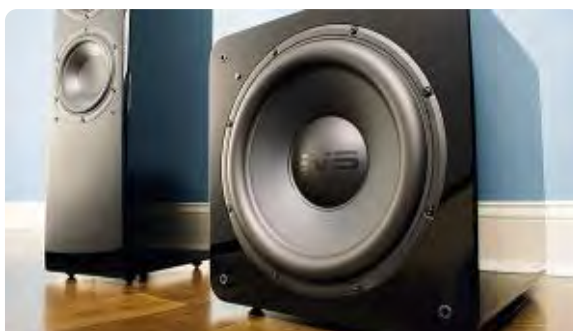
Get Your Sub Singing!