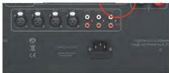
Keeping it Simple