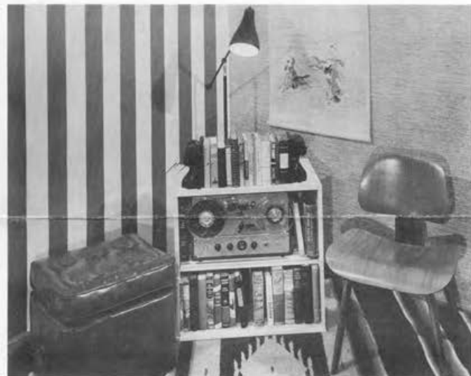
The New M-33 Portable Magnecorder Installed in a Ready Made Cabinet

Magnecord has entered the high-fidelity consumer market with the introduction of two portable magnetic tape recorder-playback machines to retail at $299.00 and $329.00 each. The decision to make Magnecord equipment for the general public was prompted by "increased demand for high fidelity recorders that are easy to operate, and the recent introduction of pre-recorded magnetic tape reels for general use," according to Wm. L. Dunn, Magnecord president.