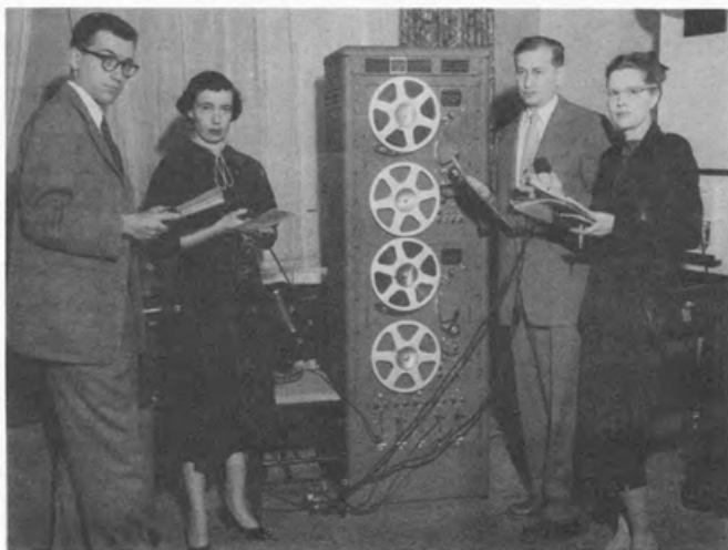
Shown above is the Magnecord four-channel single-tape recorder demonstrated at the Institute of Radio Engineers annual meeting in New York, March 22-25. The new recorder will be marketed at approximately $5,000.

The new recorder is believed to have immeasurable value in the medical field. For the first time, an accurate on-the-spot account of a surgical operation is now possible by permitting up to four surgeons and attendants to record all oral observations by the use of lip microphones. Other immediate uses include the permanent recording of inter-communications between police, fire and similar civil safeguard bodies.